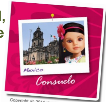
Copyright © 2011 Hearts for Hearts Girls

Can a doll change the world? You bet! Hearts For Hearts Girls™ dolls are not your ordinary toy store dolls, they are dolls with a mission! Each doll represents a real girl from one of six different countries around the world, like Tipi from Laos who loves to tell stories, Consuelo from Mexico who wants to help others, and Nahji from India who wants a different life. But these dolls do more than just tell their stories—they change the world! How? It’s simple. Every time a doll is purchased, a portion of the price is donated to World Vision to support programs for girls in countries around the globe. From school supplies to malaria nets, these outreach projects give girls the support and opportunities they need to thrive and succeed. Yes, a doll truly is changing the world!